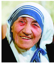
St. Mother Teresa

✠ “Kind words can be short and easy to speak, but their echoes are truly endless.”